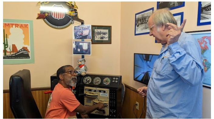
Train Simulator Operators