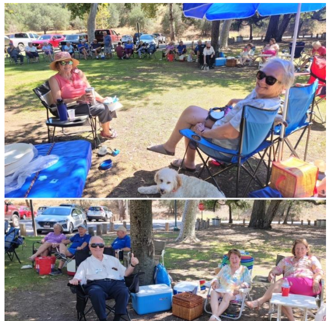
Club Picnic 2022