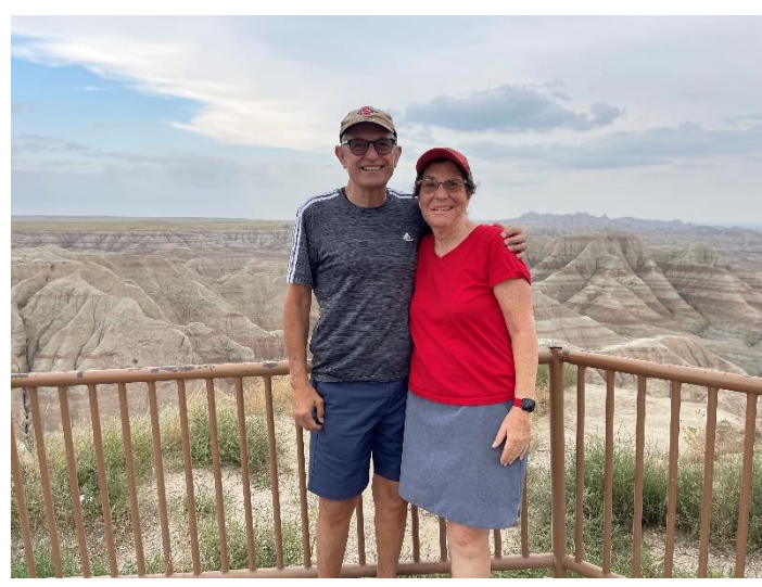
Badlands National Park