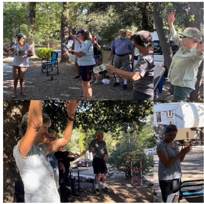
Take Me Out to the Ballgame!

What do you have when you assemble thirteen rigs of RV Wheelers (plus two former RVers) in a beautiful wooded park in the mountains near Julian? FUN! You have fun!