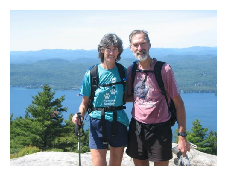
While raising our 2 children we were tent campers...laughing at RVs...that's not camping!