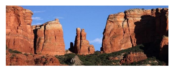
Spring Training & Sedona, Arizona March 11-18, 2024/Lost Dutchman State Park March 18-25, 2024/Dead Horse Ranch St. Park