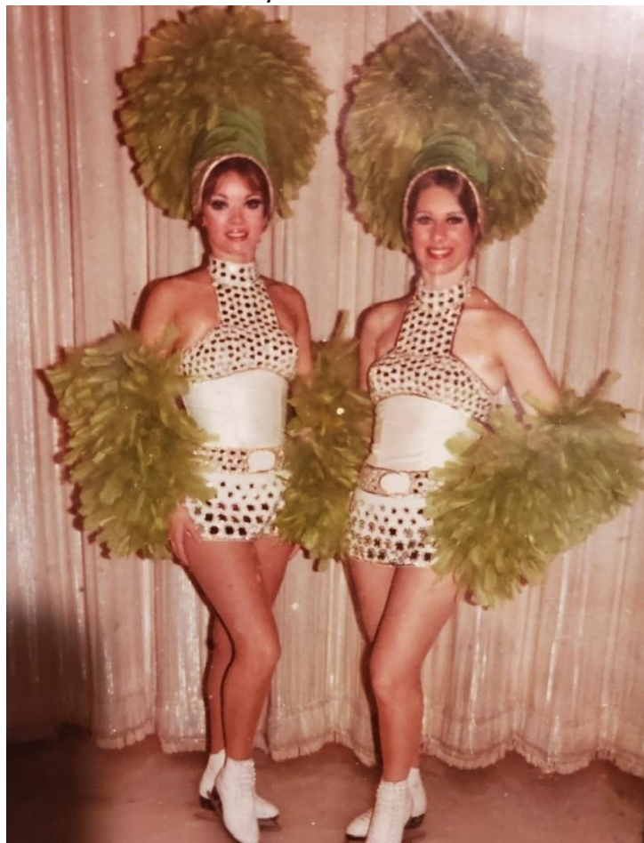
Shipstads & Johnson Ice Follies 1971. I'm the one on the left.

I turned pro right out of high school with a contract to skate with Shipstads & Johnson Ice Follies & Holiday On Ice.