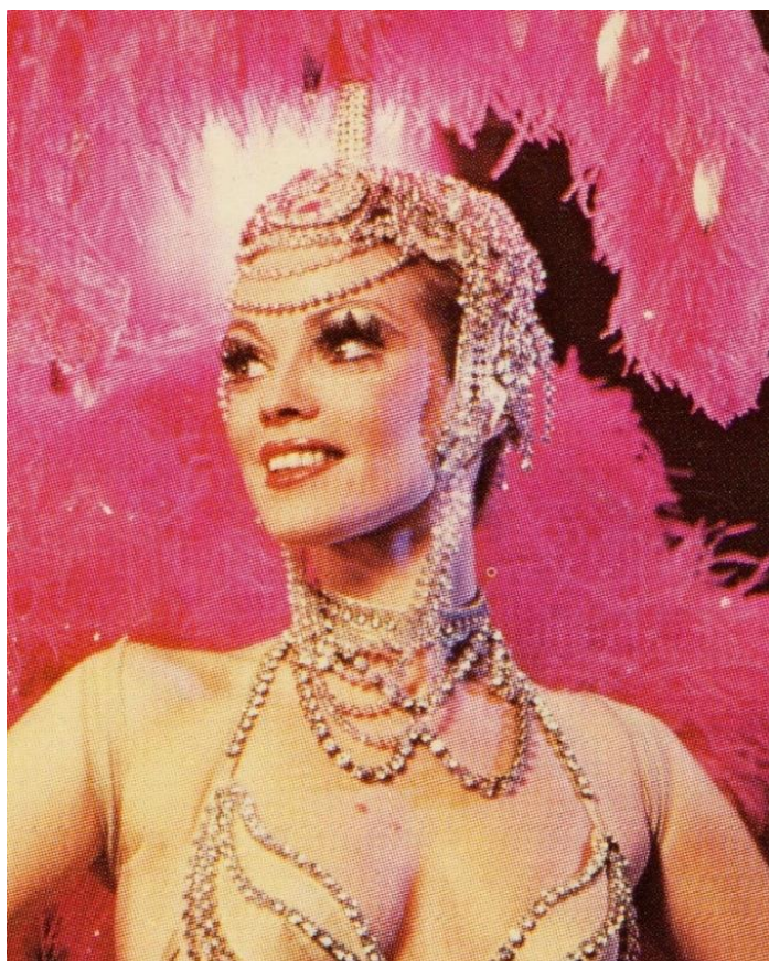
Las Vegas show called Razzle Dazzle @ the Flamingo Hotel and Casino.