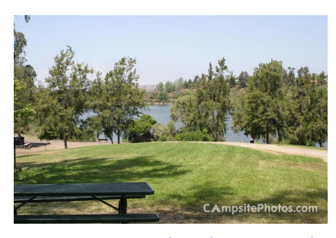
Guajome Regional Park, Oceanside February 11-15, 2024 – 16 sites reserved Total Cost: $135/4 nights – Waiting List