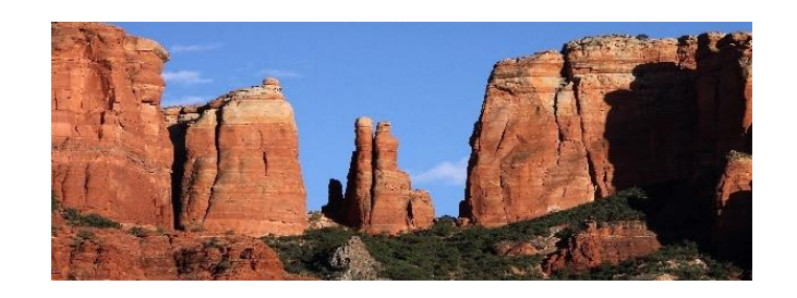
NEW: YUCAIPA REGIONAL PARK APRIL 14-18, 2024 – 10 spots available Total Cost $170/4 nights-See Attached Flier

Spring Training & Sedona, Arizona March 11-18, 2024/Lost Dutchman State Park March 18-25, 2024/Dead Horse Ranch St. Park 12 Rigs Attending – Waiting List