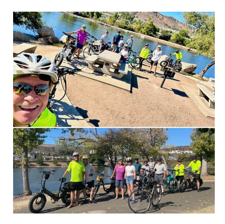
We loved the bike rides around the lakes