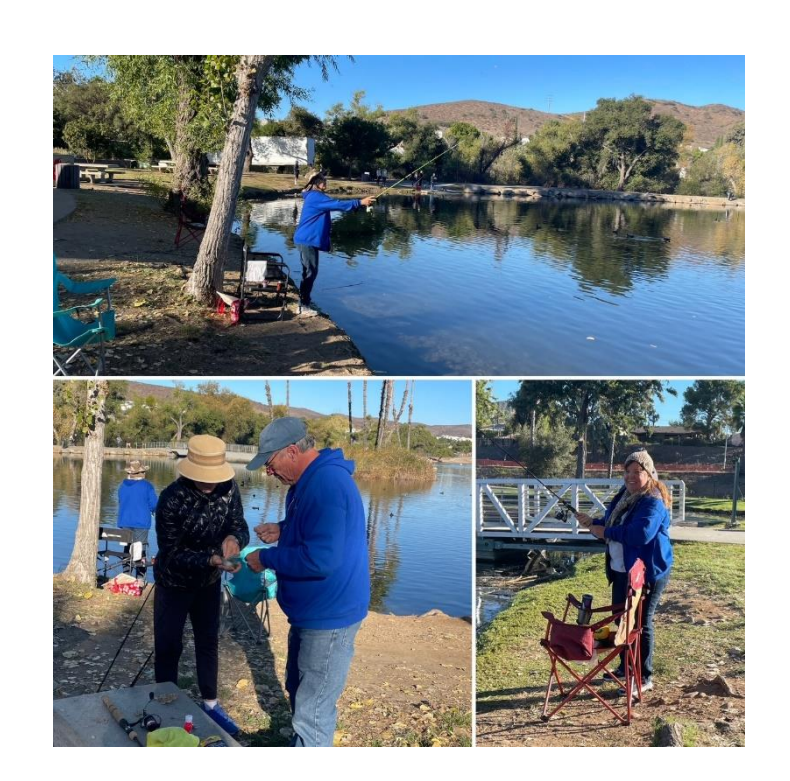
Tranquil lakes – perfect for early morning fishing . . . .