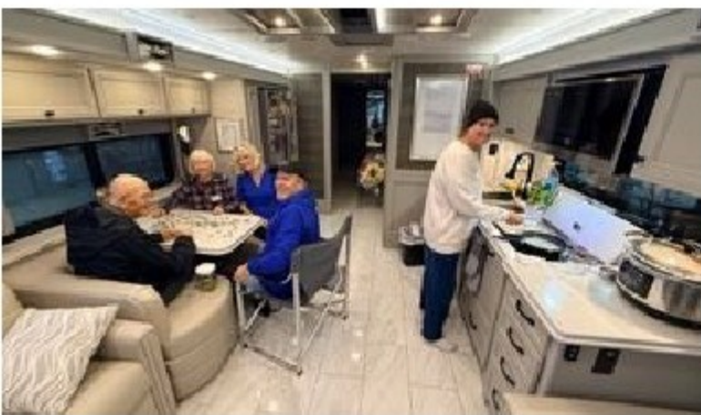
When thunder roars, go indoors!

In spite of the off and on rain the campout was considered a success because the campers would not let it dampen their spirits.