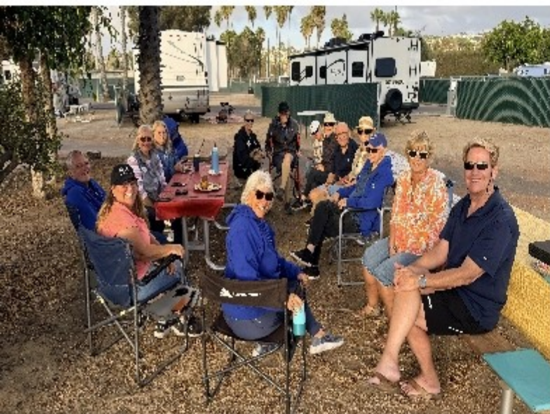
Mission Bay group

It should be noted that if you plan to go to Mission Bay North Park be sure to take extra cables and hoses because the hookups are all at the front of the sites, as they were for the mobile homes.