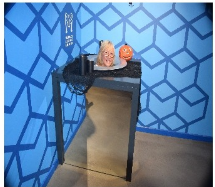
Her head isn't really on a platter