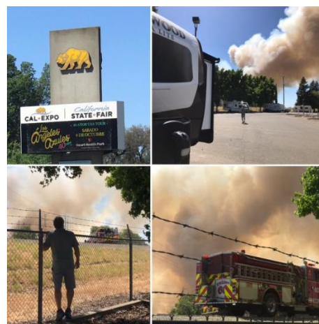
Sacramento waterfront and brush fire right behind the Cal Expo RV Park! Too close!!