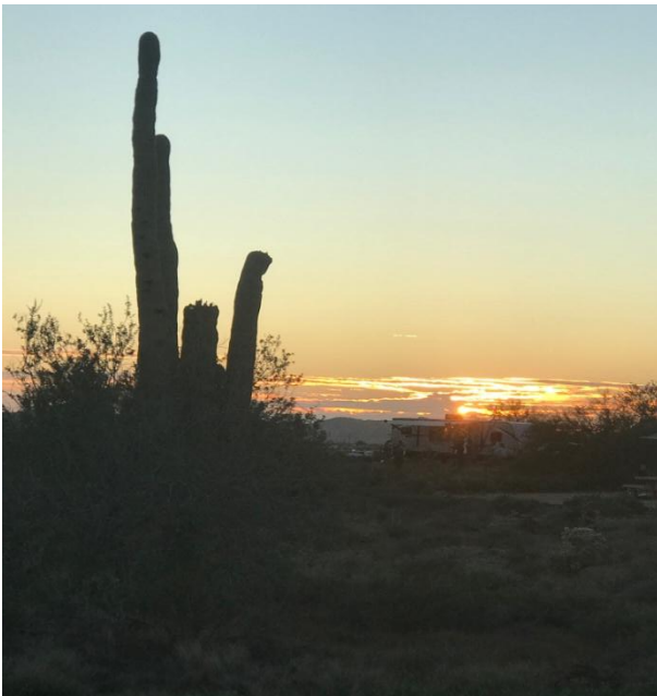
Arizona Desert Cactus

Trade Show | Quartzsite Sports, Vacation & RV Show quartzsitervshow.com