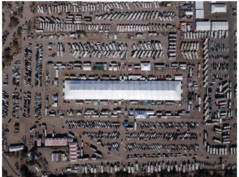
Big RV Tent (60,000 sq. ft.)