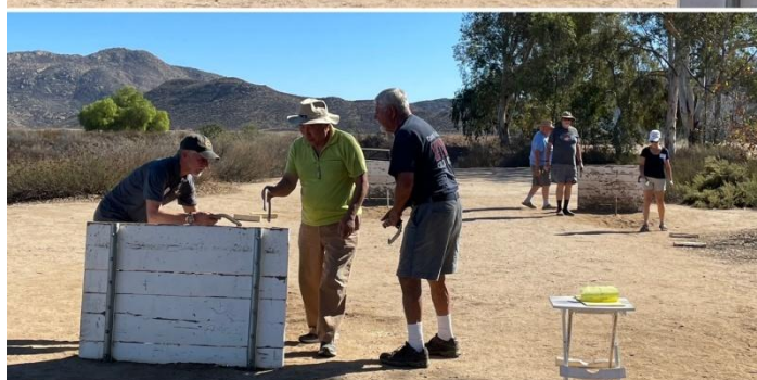
A game of horseshoes . . . . . . Complete with horseshoe fans!