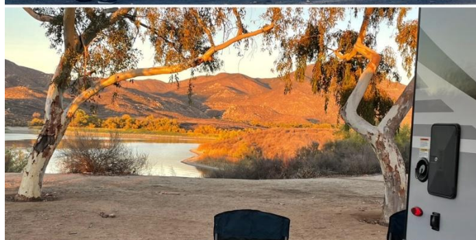
A colorful, tranquil lake setting with perfect weather and . . .