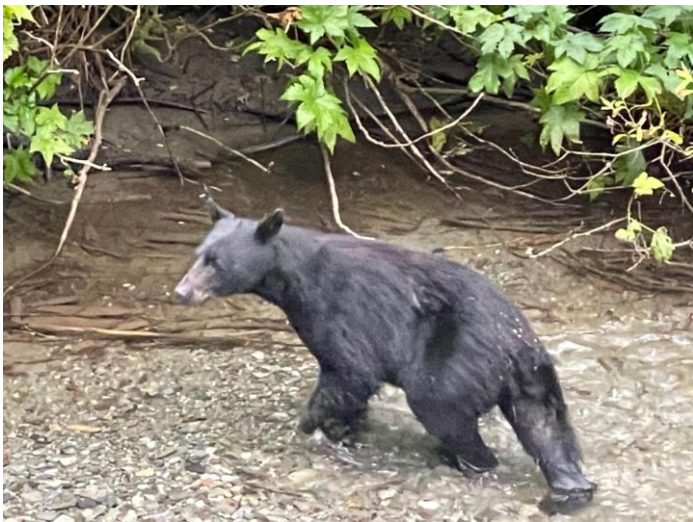
Black bear in Fish Creek, Hyder AK. From observation deck – about 20 yards away.