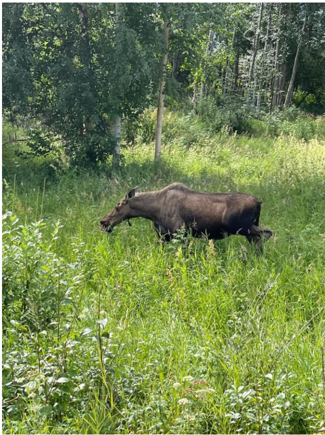
Moose on side of the road – 10 yds from RV – So. of Fairbanks