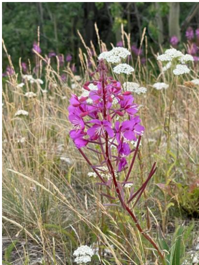
Pretty Alaska Fireweed