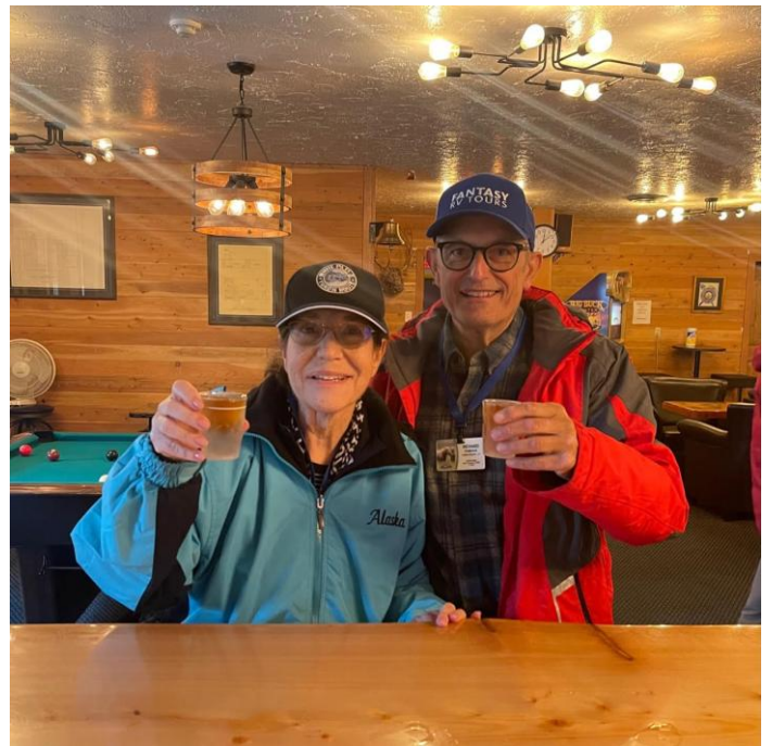
Fireball Shot at Skagway Elks Lodge