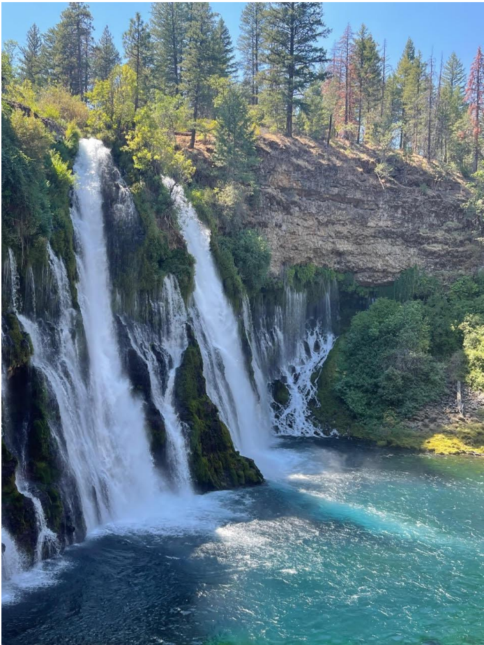
Burney Falls, California