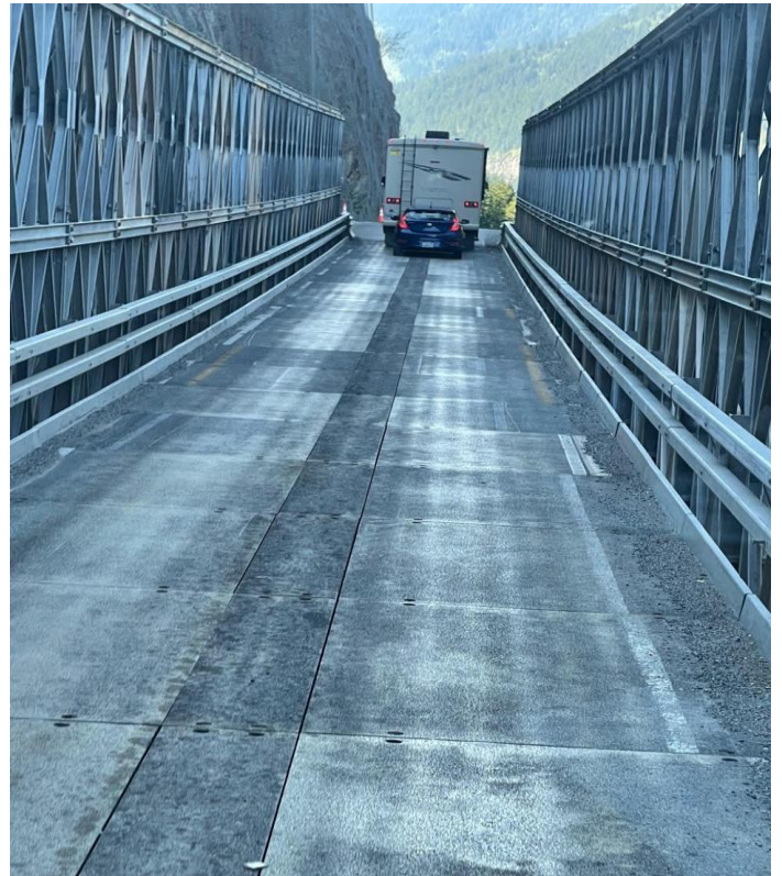
Road construction – single lane and single RV at a time. Frazer Gorge.