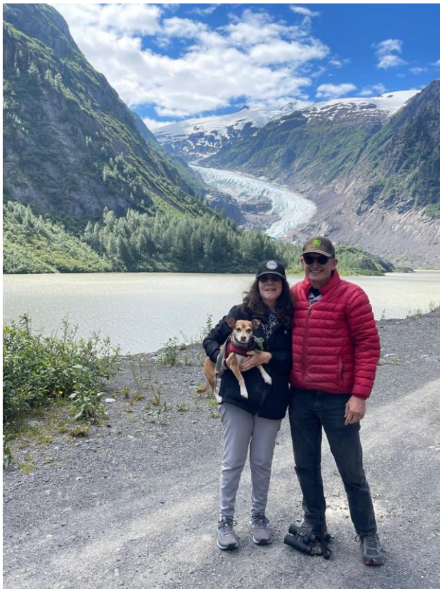
Beaver Glacier Stewart, B.C.