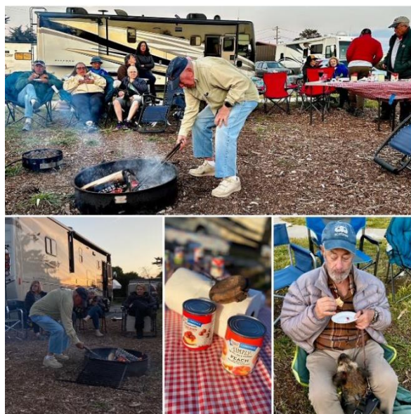
Ron's Campfire Pies