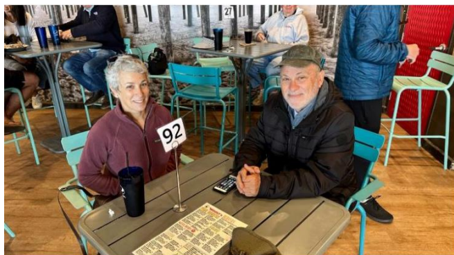
Wooly's in Pismo Beach