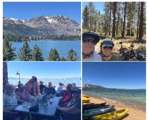
Several of us went on to South Lake Tahoe.