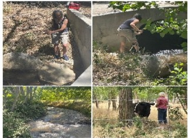
No fish this year - but several cows were our neighbors!