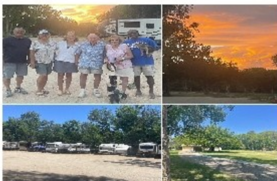
Beautiful setting at the Elks Lodge