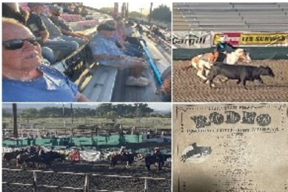
High School Rodeo State Championships at the Tri County Fairgrounds.