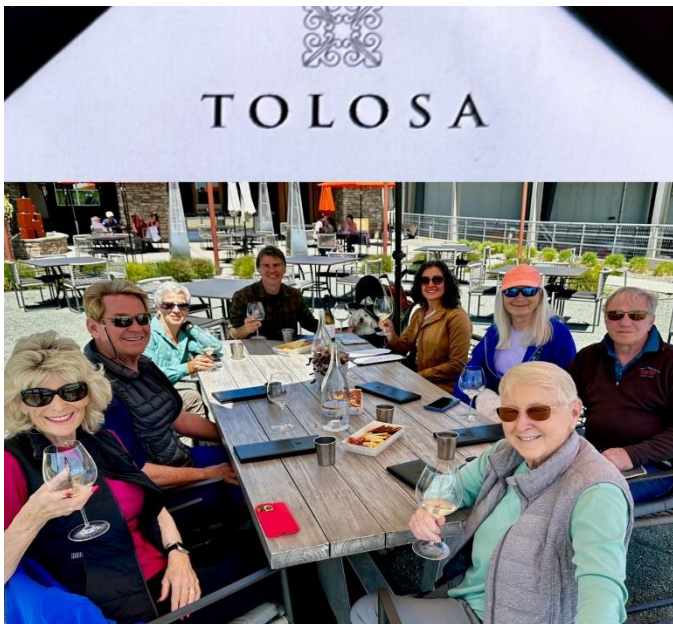
Wine Tasting in Edna Valley & in camp!!