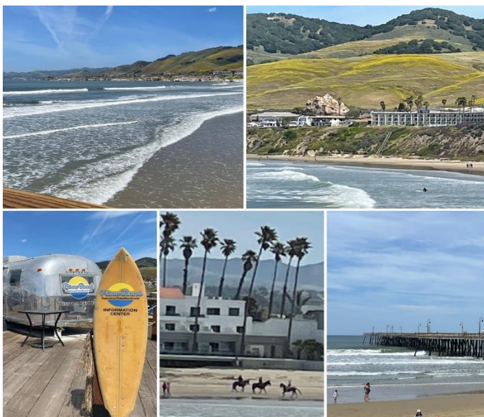
Pismo Beach Pier